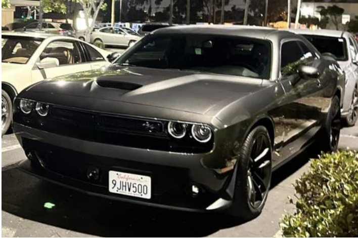
Our President has gone over to the 'DARK' side!