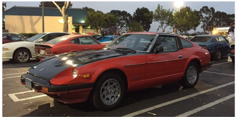
Nice line up of Z cars