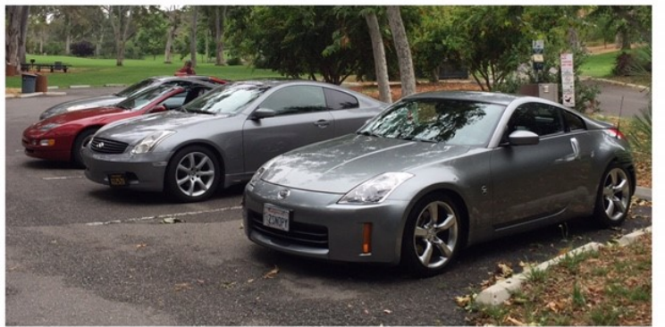
Car show display