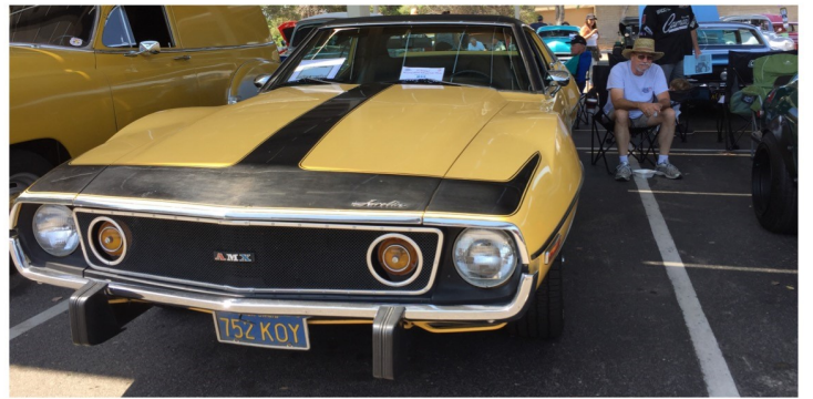
Good variety of cars